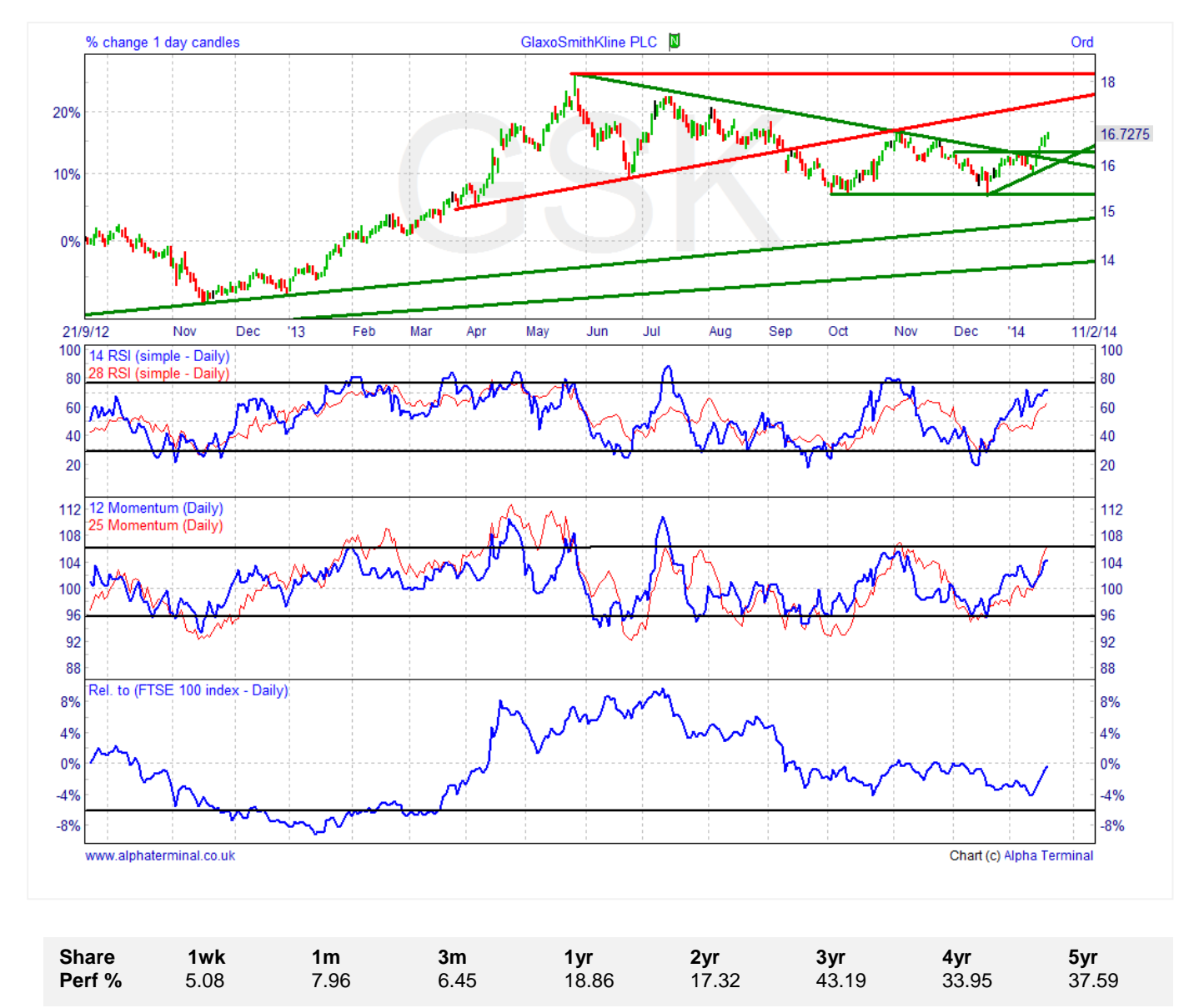
Graph: 1.5-year (daily) - RSI, Momentum and Performance relative to FTSE 100

Need help understanding this page? Click