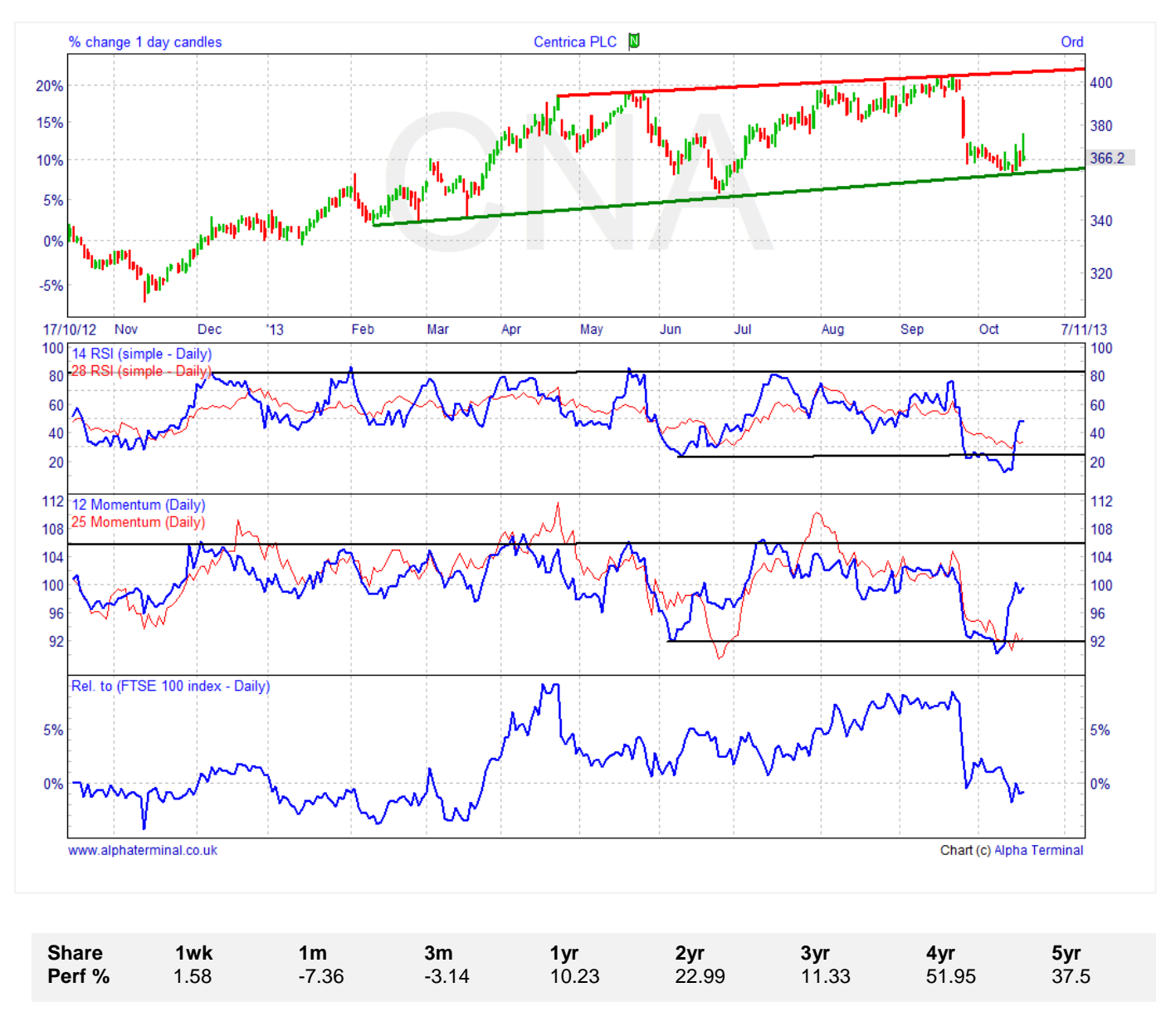
Graph: 1-year (daily) - RSI, Momentum and Performance relative to FTSE 100

Leveraged products involve a high level of risk and you can lose more than your original investment. They are not suitable for everyone so please ensure you understand the risks involved and if necessary please obtain investment advice from a financial adviser before investing. This report is not a personal recommendation and does not take into account your personal circumstances or appetite for risk.